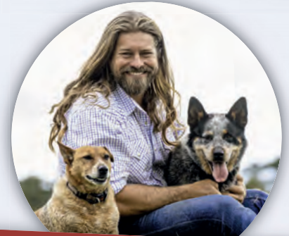
FARMER DAVE K9 SUPPER WALL & TEMPTATION ALLEY

INTERACTIVE LIVE SHOWS Bookings are essential