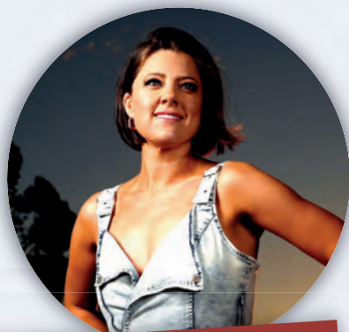
AMBER LAWRENCE 6 TIMES GOLDEN GUITAR WINNER

MUSWELLBROOK SHOWGROUND - Upper Hunter Valley -