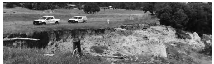
This photo shows the contrast where there is no native woody-vegetation protection and where there is native vegetation present.

Government Authorities are more likely to assist when landholders will commit to land management and soft option works and the correct land management. Regrettably, I have heard so many times if I fence this area off, I will lose so much land. Failure to introduce correct land management aligned to the area - land capability really means you are going to lose that land to damage and vast restoration expenditure. You can check with Government Departments and Authorities what flood disaster funding is available. If the area gets to the stage only revetment and engineering works are required as part of the answer it can be a massive cost. They will require a complex assessment and design; such works require approval.