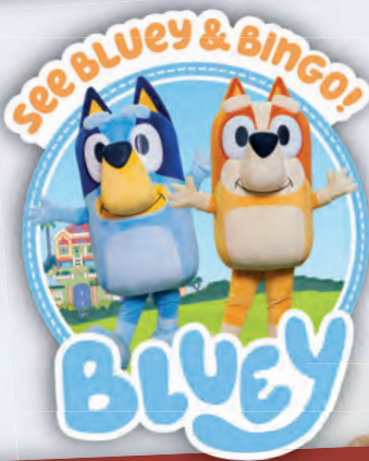
BLUEY TM and BLUEY character logos TM & © Ludo Studio Pty Ltd 2018